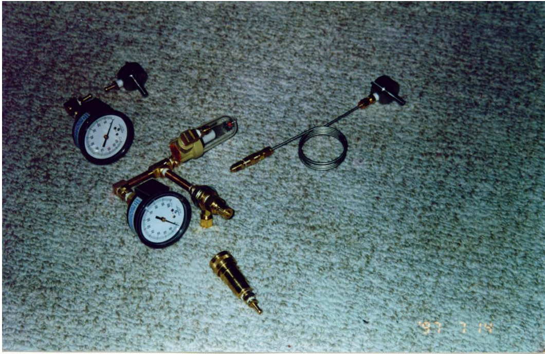
Figure 2: Components of Flameproof Port Installation