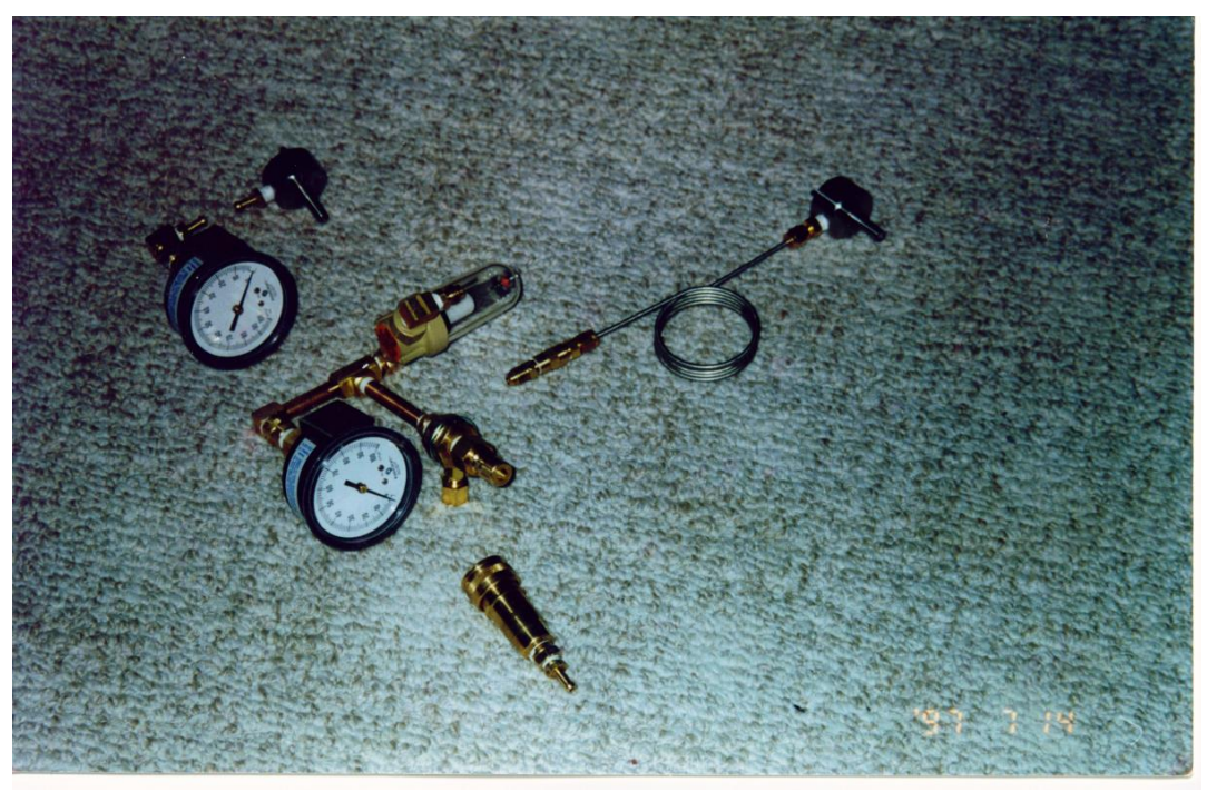
Figure 2: Components of Flameproof Port Installation

CO (Carbon Monoxide) SAMPLING INSTRUCTIONS FOR THE DST DRY SYSTEM ^{\text{TM}}