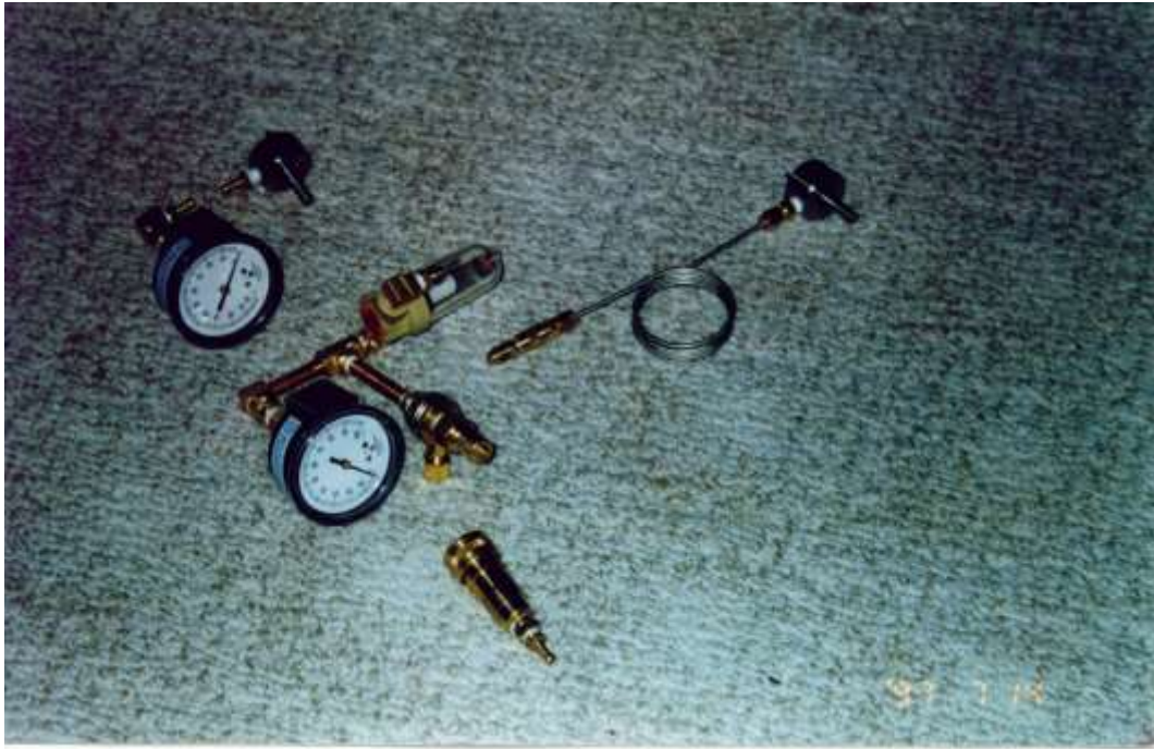
Figure 2: Components of Flameproof Port Installation